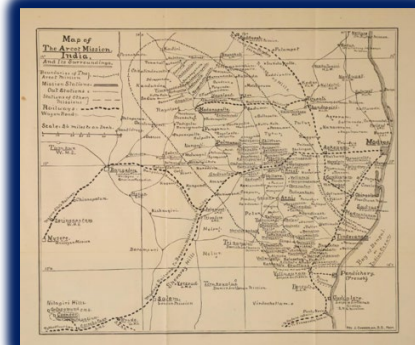
Map of the Arcot Mission, India